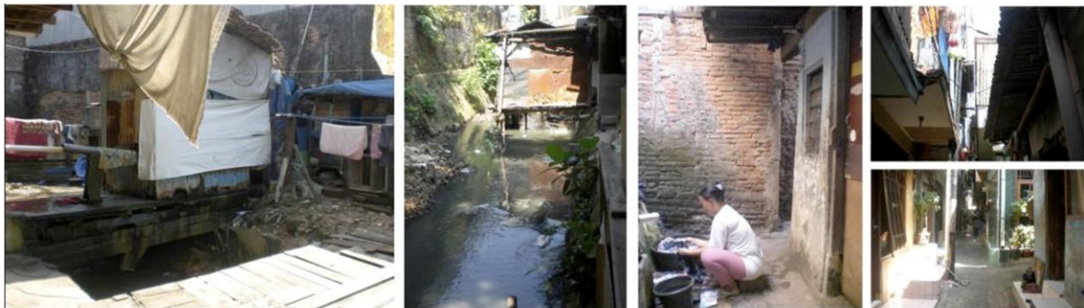
Figures from one of the research fields, Cikini, Jakarta (Indonesia)

keywords: society acceptance, effectiveness and optimization from the existing waste management system, economics benefit (self-help program)