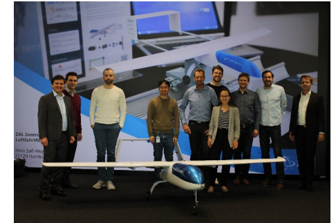
Mid-term milestone meeting at ZAL on April 10, 2024

HYDRO-BUNNY opens up new possibilities for the use of UAVs in critical and demanding missions. For example, drones could control large hilly areas of forest thanks to self-sufficient energy supply and autonomous hydrogen refueling. The integration of liquid hydrogen technology significantly increases the range and enables long-duration missions with minimal maintenance effort.