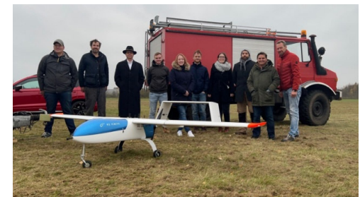
First flight at Rotenburg airfield on November 8, 2024